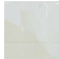
White marbled subway tile