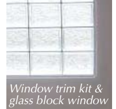
Window trim kit & glass block window