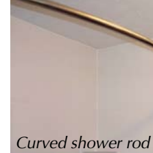
Curved shower rod