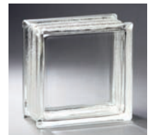
THICKSET® 90 Block, VUE® Pattern