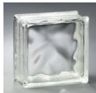
THICKSET® 90 Block, DECORA® Pattern