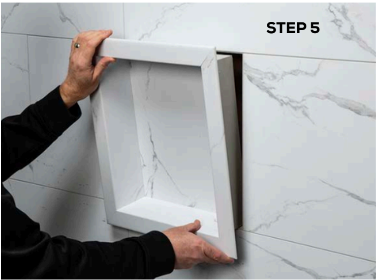
Carefully place the shower niche into the opening.