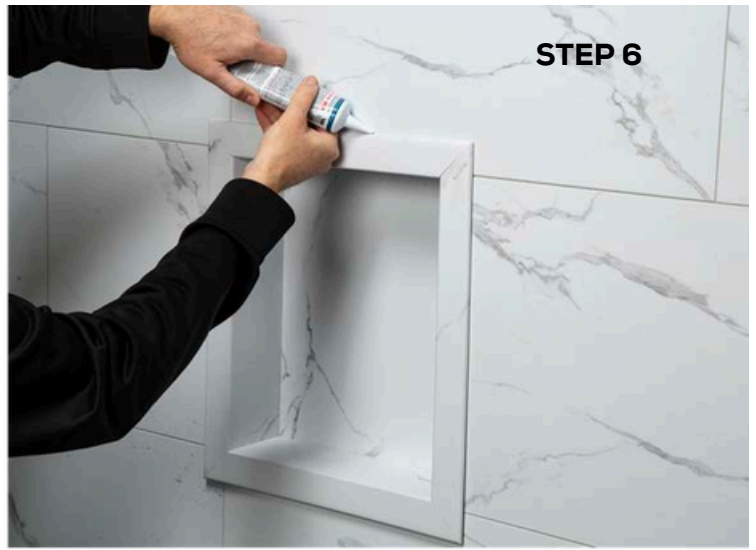
Once it is in place, wipe off any excessive sealant. As added protection, you can place a small bead of sealant on the top edge only.